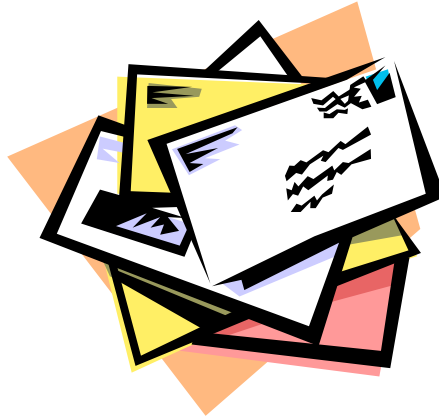
A letter from the Doctor

I also have been doing research on information that is important to me as a Chiropractor and studies that will interest you as patients. Watch for important health conscious information